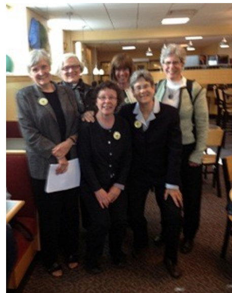
Muusan Lobby Day participants.