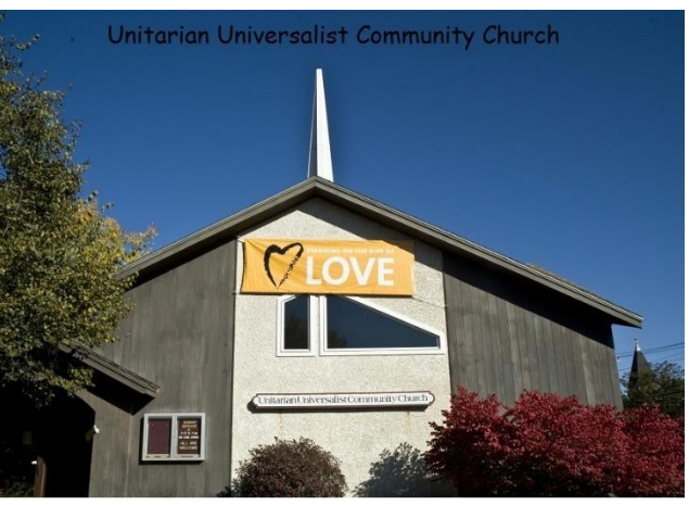
69 Winthrop St., Augusta ME