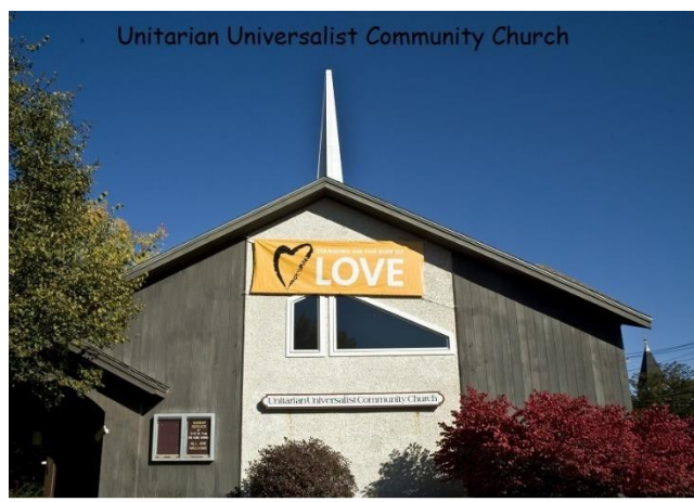
69 Winthrop St., Augusta ME