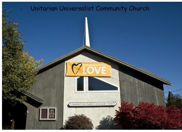
69 Winthrop St., Augusta ME