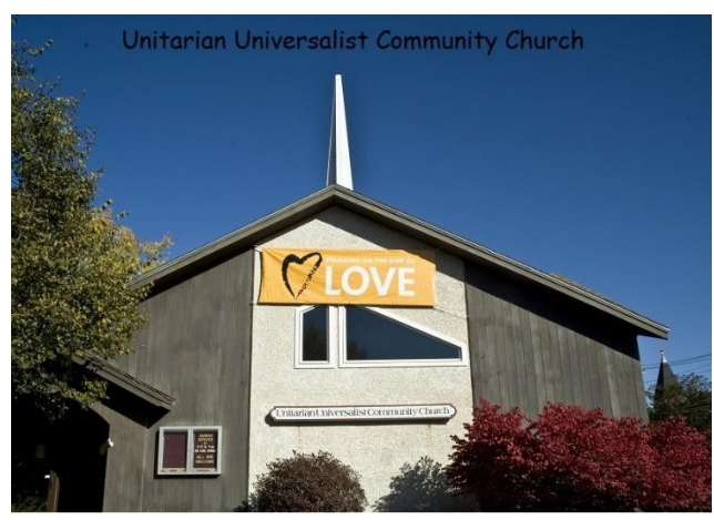
69 Winthrop St., Augusta ME