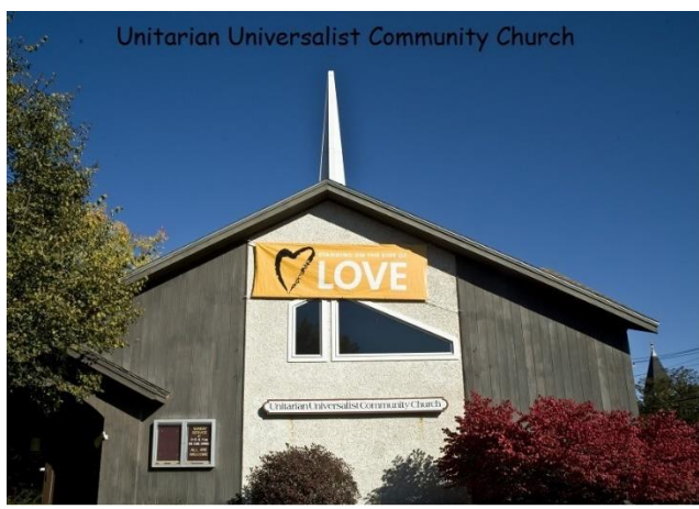
69 Winthrop St., Augusta ME