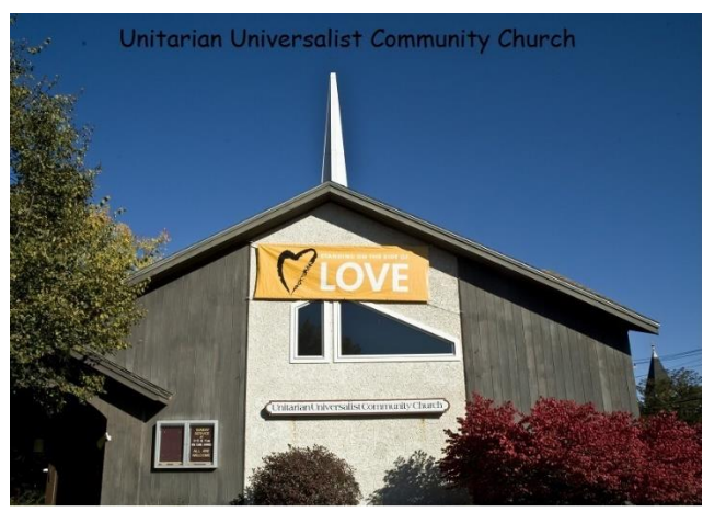
69 Winthrop St., Augusta ME