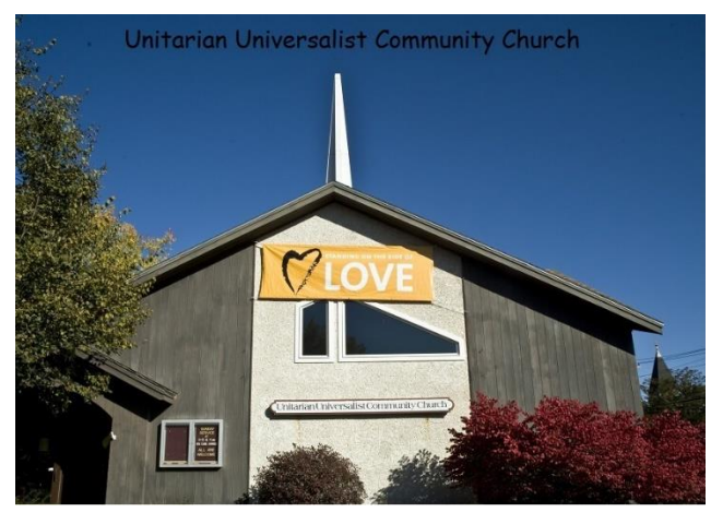
69 Winthrop St., Augusta ME