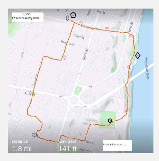
See the attachment to this E-blast for all the stop details and more...

A BYO picnic and a congregational blessing will follow the walk.