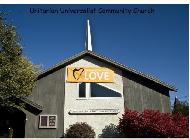
69 Winthrop St., Augusta ME