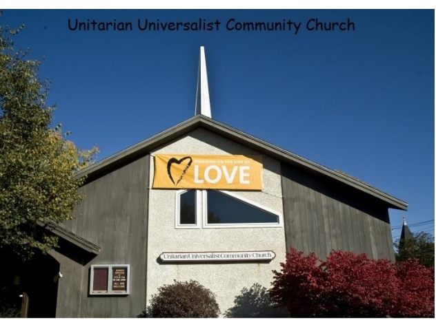
69 Winthrop St., Augusta ME